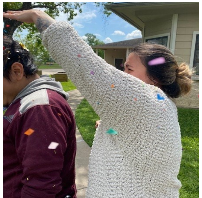
Confetti eggs with staff and members!